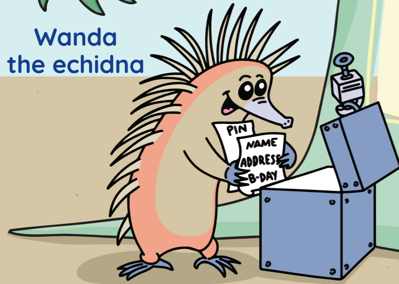
Wanda the echidna