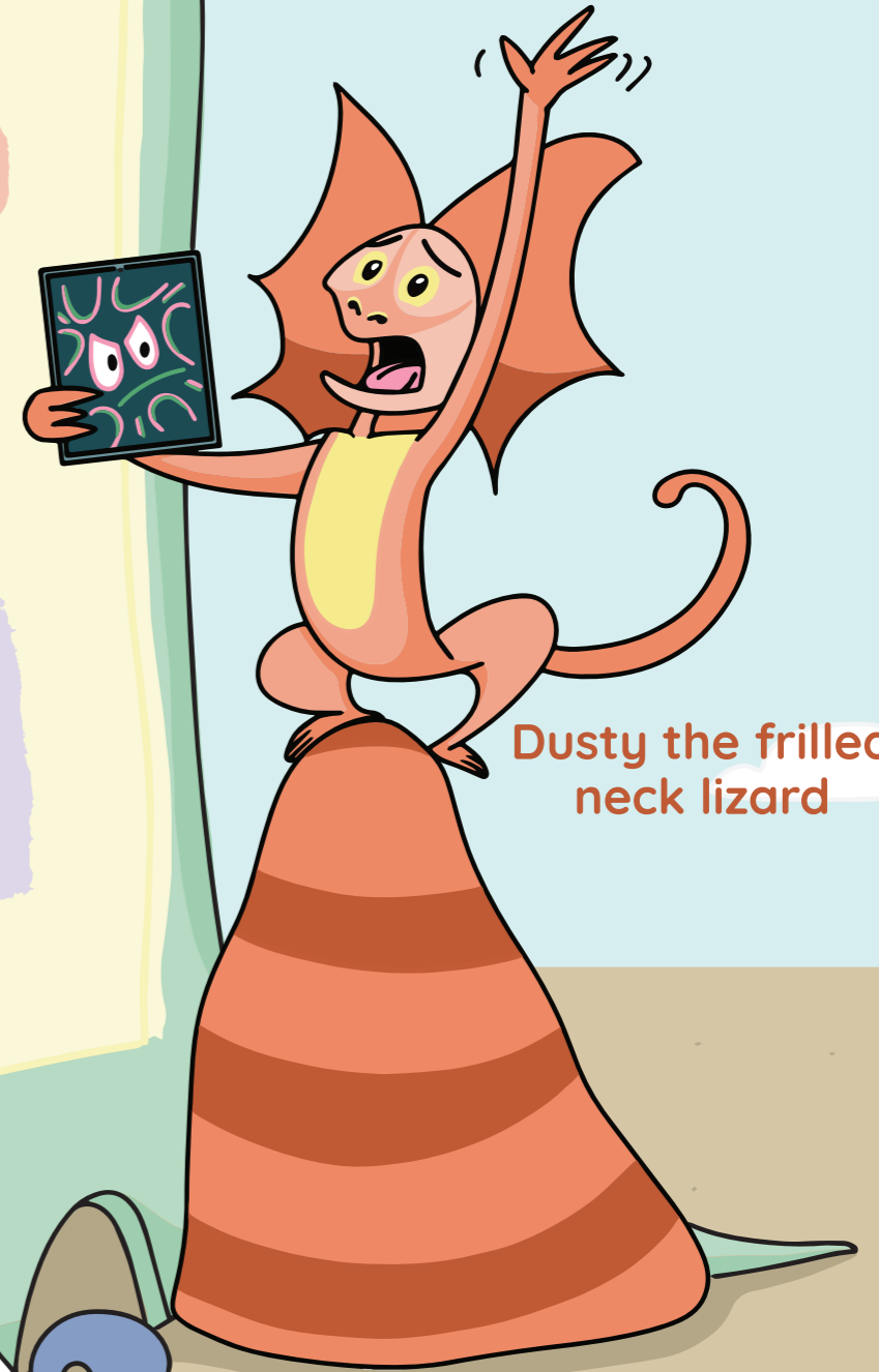
Dusty the frilled neck lizard