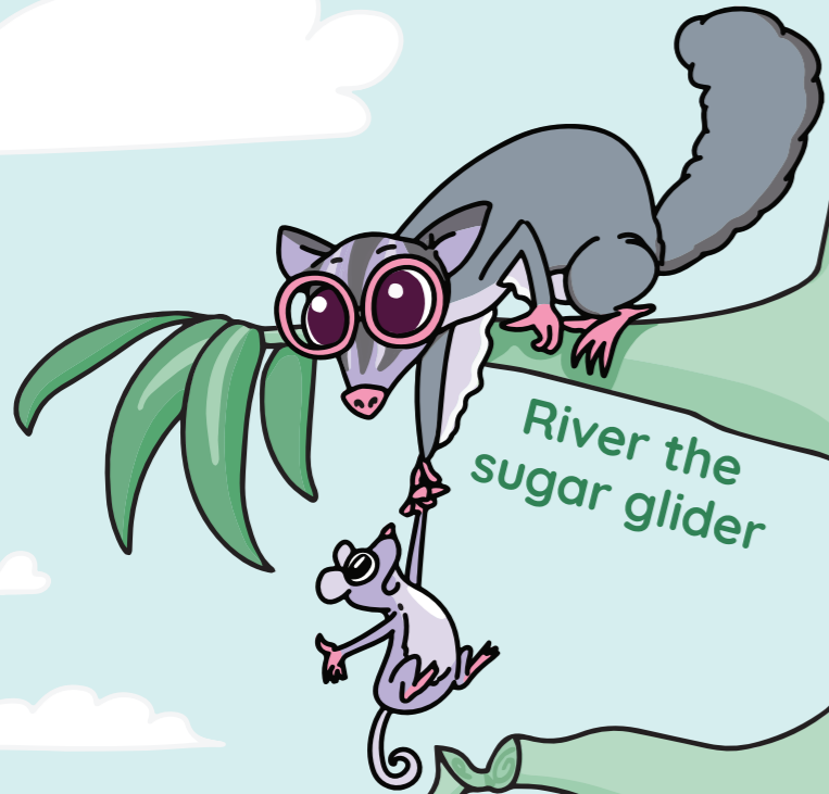
River the sugar glider

We investigate – we question what we see, hear and do online.