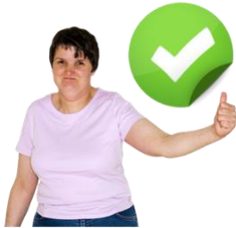
Image-based abuse is when someone shares private photos or videos of you without your consent.

Consent means you have agreed to let someone share these photos or videos.